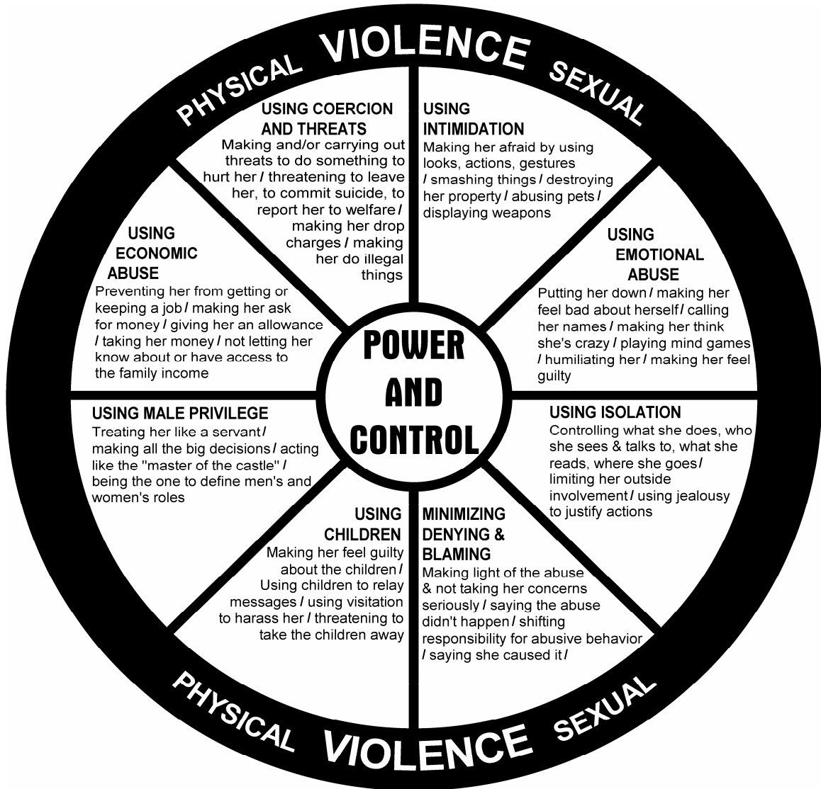
Figure 2: Power and Control Wheel

From “A Guide for Conducting Domestic Violence Assessments” by Domestic Abuse Intervention Project, 2002, appendix C-1. Copyright 2002 by Domestic Abuse Intervention Project. Reprinted with permission of the editors.